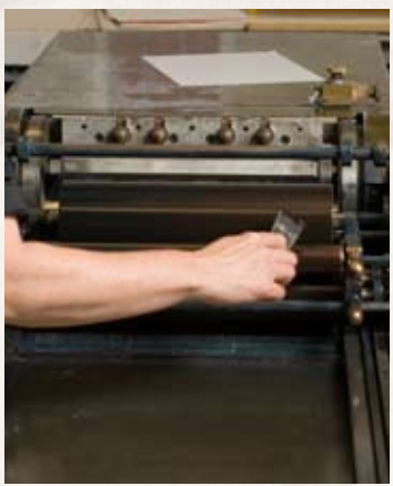
▶Ink is applied by hand to rollers on press