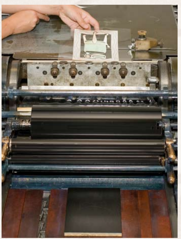
The matix is a flexible plate that is placed underneath the printing paper and run through the press over an inked up flat block

Stratography or pressure printing is the name of the technique for printing images by putting a textured flexible plate underneath the printing paper and running that through the press over an inked up flat or tint block.