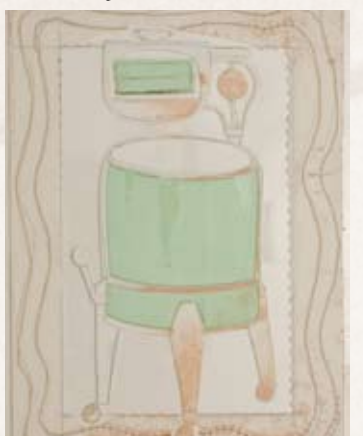
Matrix can be sewn into to create texture