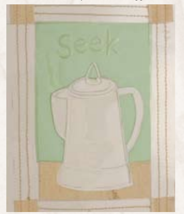
Tape and Glue can be applied to matrix to yield specific textures