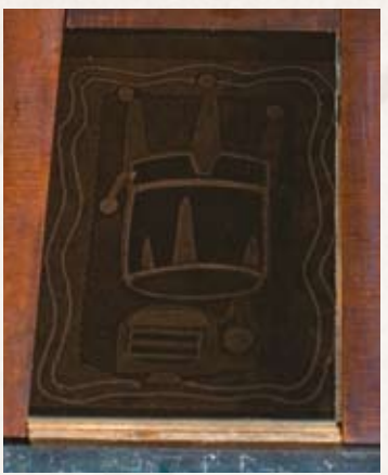
Ghost image left on block can be printed