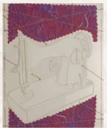
Textured Paper can be be attached to matrix