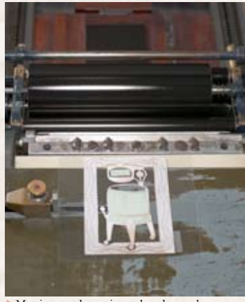
Matrix must be registered underneath paper