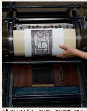
Run matrix through press underneath paper