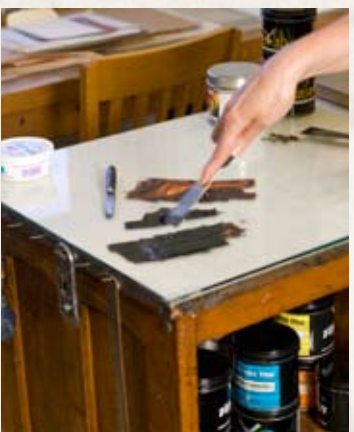
Ink can be mixed by hand before application