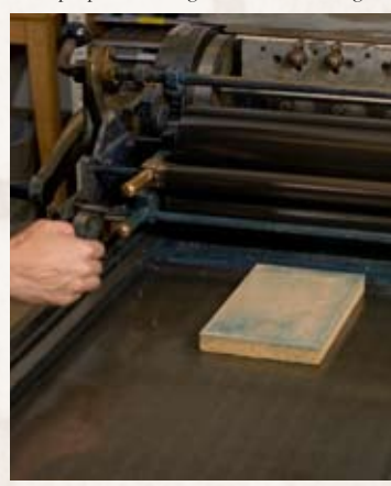
Adjust roller height to accomodate for matrix