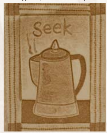
Sample print showing textures from glue and tape