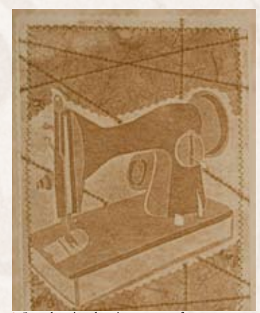
Sample print showing textures from paper