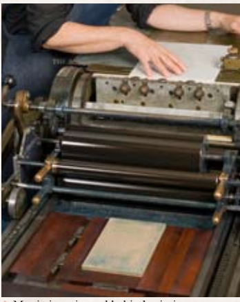
Matrix is registered behind printing paper