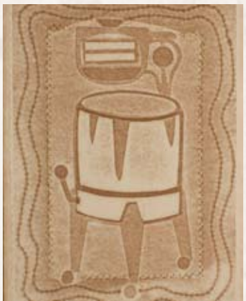
Sample print showing texture from sewing